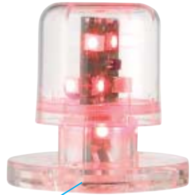
LED-bulb shown in socket