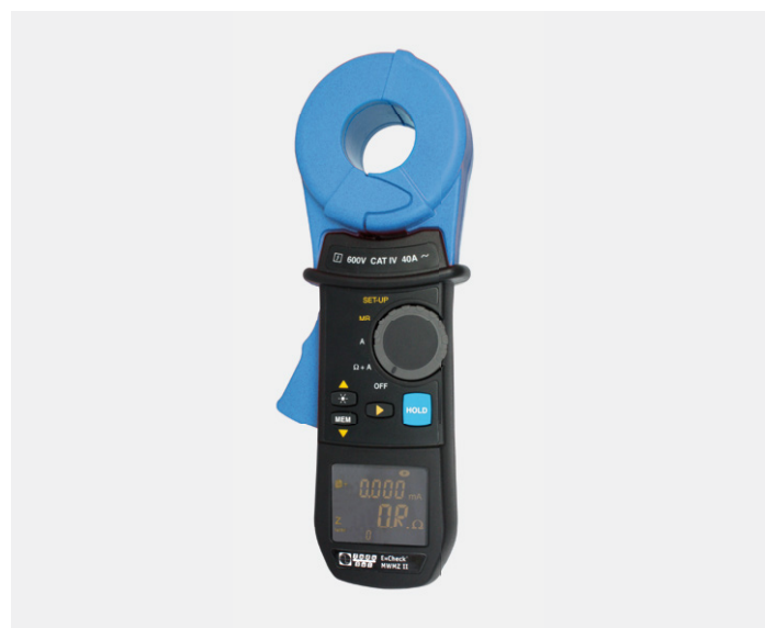
EmCheck® MWMZ II